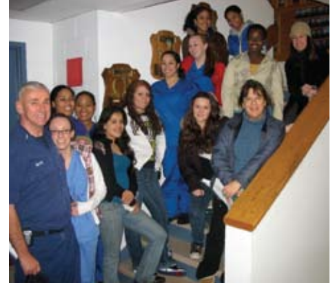
Students visit the Otis Air Base