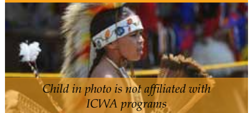
Child in photo is not affiliated with ICWA programs

The Mashpee Wampanoag Tribe Indian Child Welfare Act (ICWA) Department is looking for Tribal Members that are interested in becoming a foster parent. The ICWA Department is in desperate need of individuals to step forward and give our next generation the warm, loving and safe home they deserve.