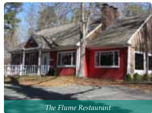
The Flume Restaurant