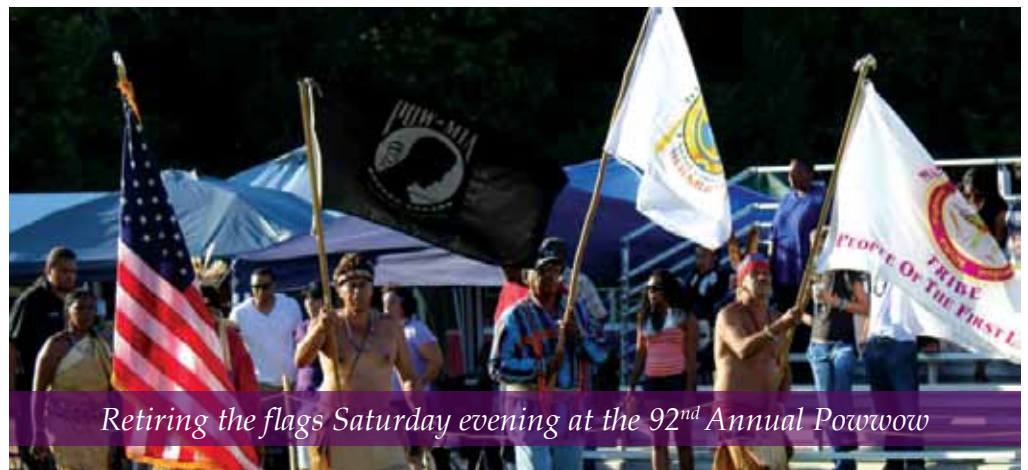
Retiring the flags Saturday evening at the 92 nd Annual Powwow