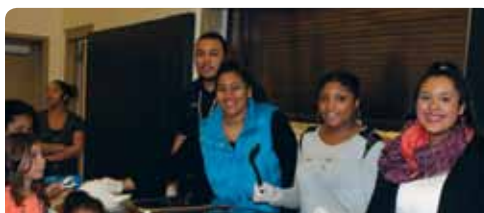
Members of our Youth Council volunteering at this year’s Christmas Party.