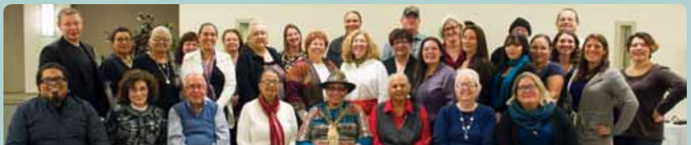
Dawnland Voices dinner held at the University of New Hampshire for the authors who briefly read one or two pieces from his or her tribal nation.

Not all stories are told in this collection, simply because all Native nations have lots of stories to tell yet.