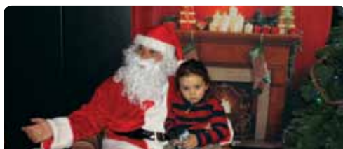
Santa spreading holiday cheer at Children’s Christmas Party on December 13.