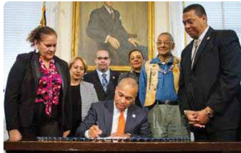
Governor Patrick signing compact on November 15 that has received BIA approval.