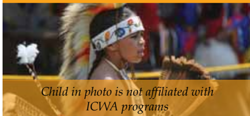
Child in photo is not affiliated with ICWA programs

The Mashpee Wampanoag Tribe Indian Child Welfare Act (ICWA) Department is looking for Tribal Members that are interested in becoming a foster parent. The ICWA Department is in desperate need of individuals to step forward and give our next generation the warm, loving and safe home they deserve.