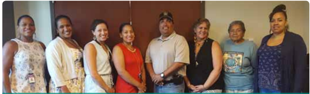
Tribal Coordinating Committee (TCC)

Immediate Output: Increase education and employment of tribal citizens