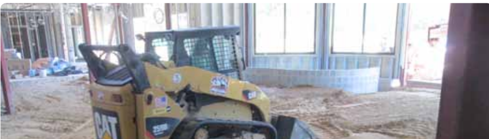
A 6-foot Mashpee Wampanoag Tribal logo will be uniquely designed as part of the Terrazzo flooring as well for all of the Tribal members and visitors to see as they walk through the doors.