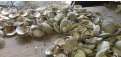
Quahog shells for the Terrazzo flooring of the Mashpee Wampanoag Government/Community Center.