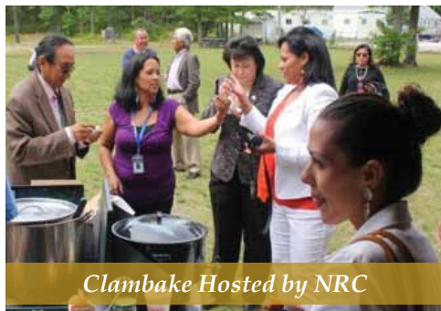
Clambake Hosted by NRC

In between meetings, we hosted an afternoon of activities for our guests that included a tour of the historical and social places of our people, including the Indian Museum, the herring run, the Old Indian Meeting House and cemetery, Tribal Headquarters, local artisans shops, the beautiful shorelines and bays, Plimoth Plantation and an extraordinary traditional clambake provided by our Natural Resource Commission.