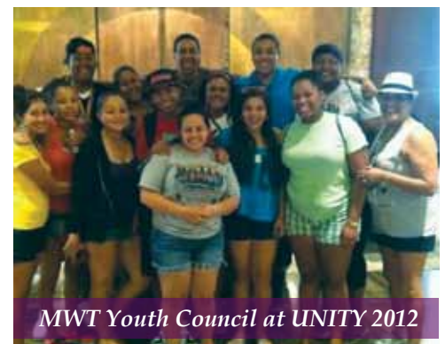
MWT Youth Council at UNITY 2012