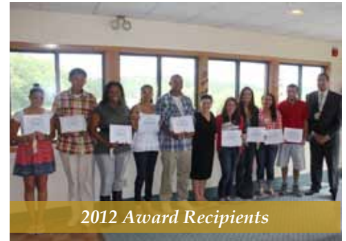
2012 Award Recipients

The function room was nicely decorated with congratulatory signs and bright balloons. Family, friends and our graduates had a great brunch and were served a nicely decorated cake. Thanks to all who participated and helped to put the program together.