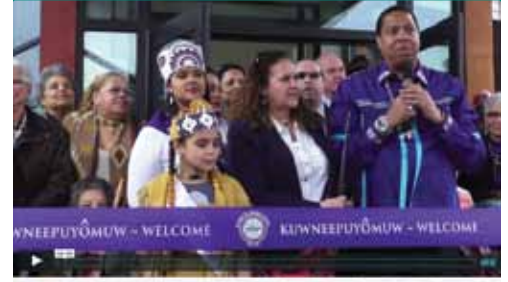
Mashpee Wampanoag Opening Celebration Mashpee TV Viewing Contributions of the Mashpee Wampanoag Tribal Community and Government Center - March 26, 2014

Coverage from the Grand Opening of our Tribal Government and Community Center can be seen on Mashpee TV. To view this coverage click on the link http://vimeo.com/91556710